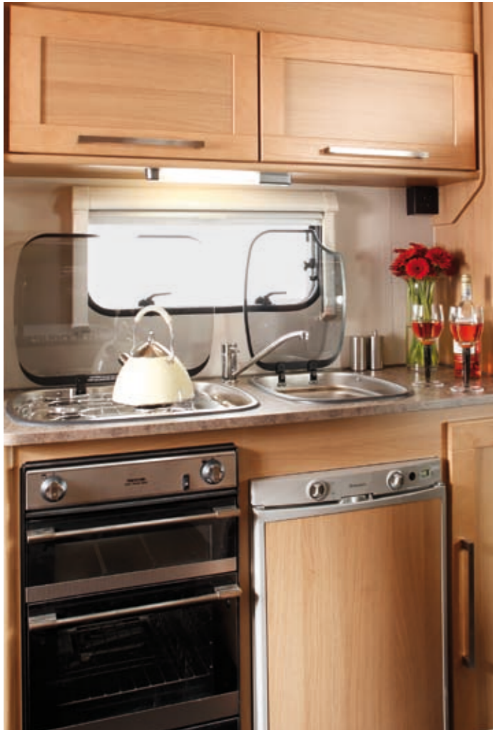
Autoquest kitchens boast domestic style appliances