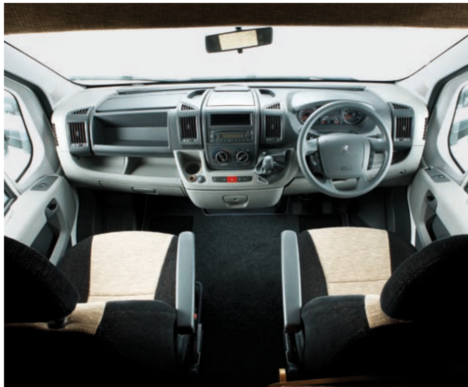
The stylish and comfortable Autoquest cab

“good job Elldis. thanks for the great time and holiday fun”