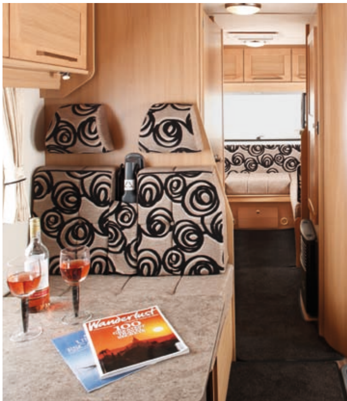
New interior design with luxurious 'Kascada' upholstery