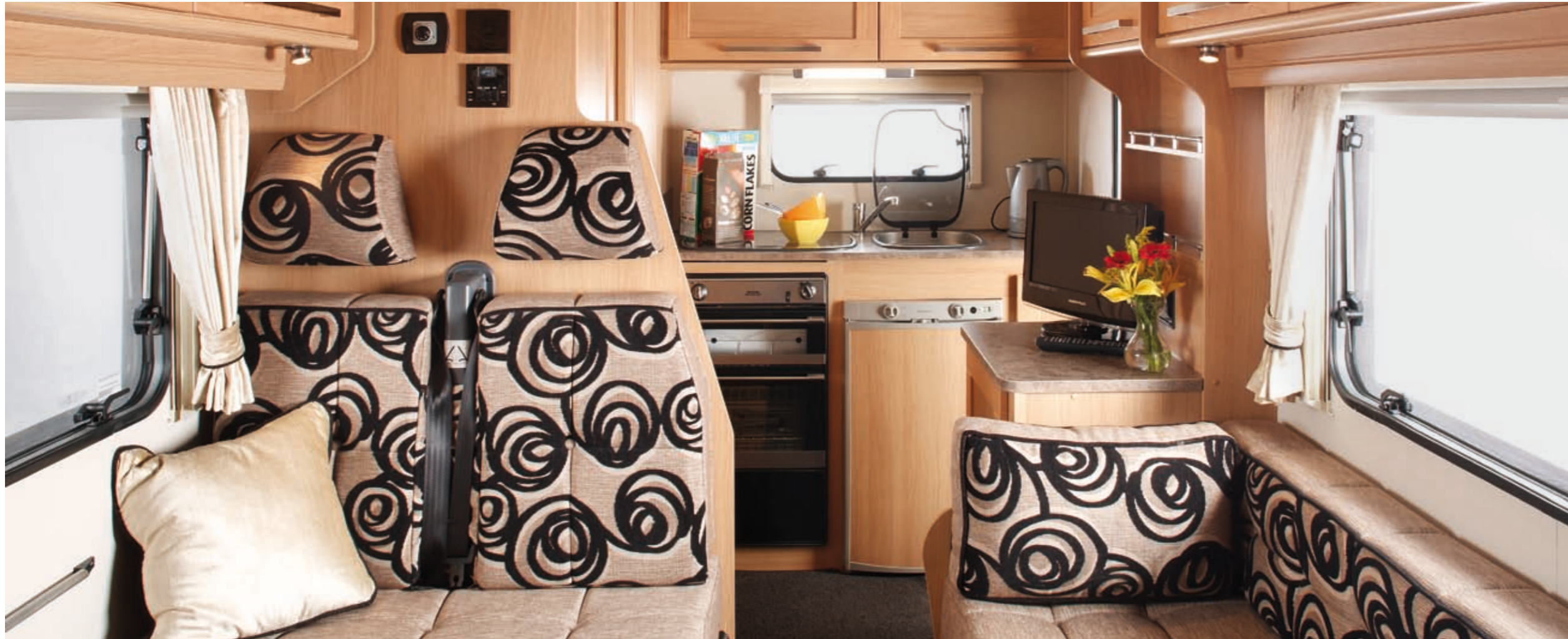
Autoquest 130 - view from cab to rear