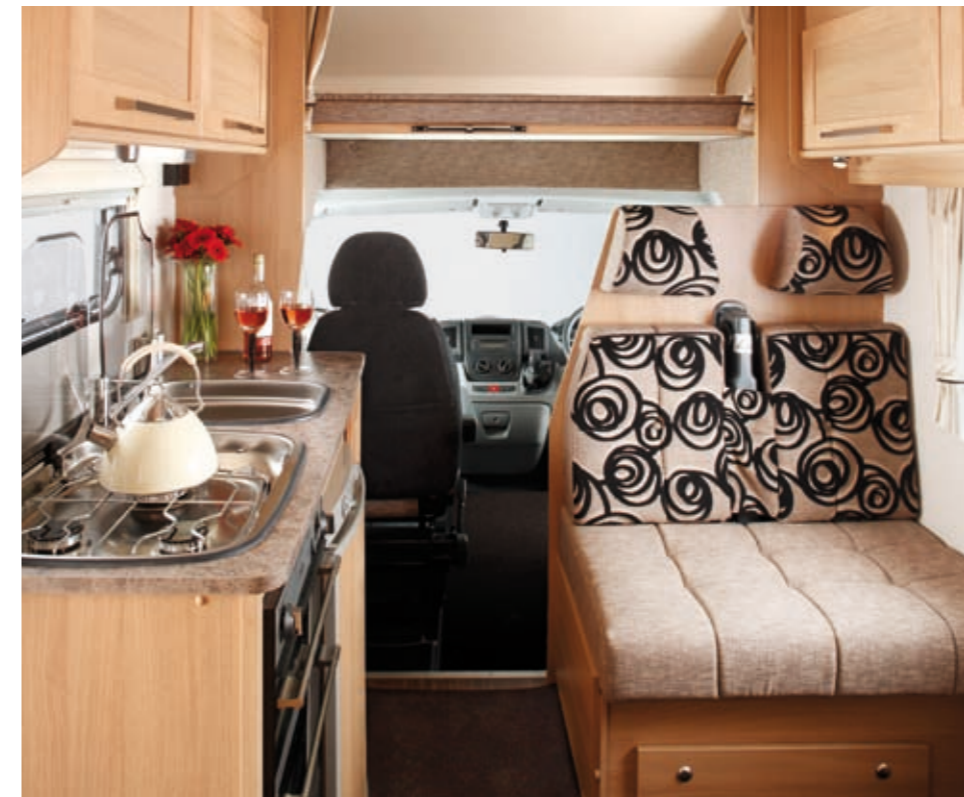
Autoquest 180 - view from rear to cab