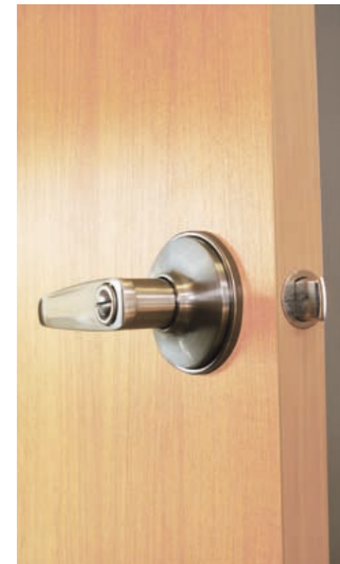
Quality finish and attention to detail